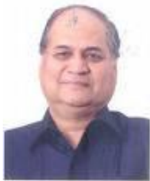
Shri Rahul Bajaj Managing Director/CEO of Bajaj Auto